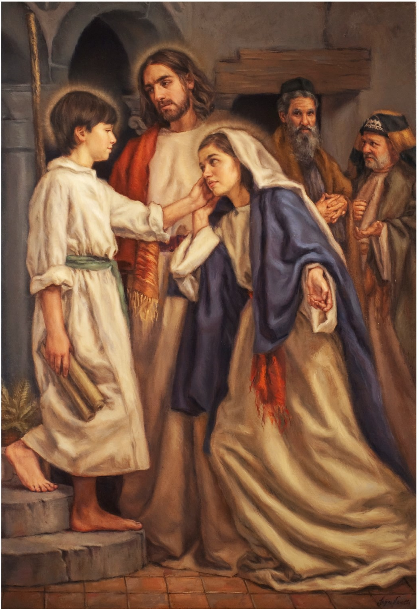
Image: Novelli, Sophia. The Finding of Jesus in the Temple, http://www.sofianovelli.com/it/arte-sacra/il-ritrovamento-di-gesu-nel-tempio , Used with permission.